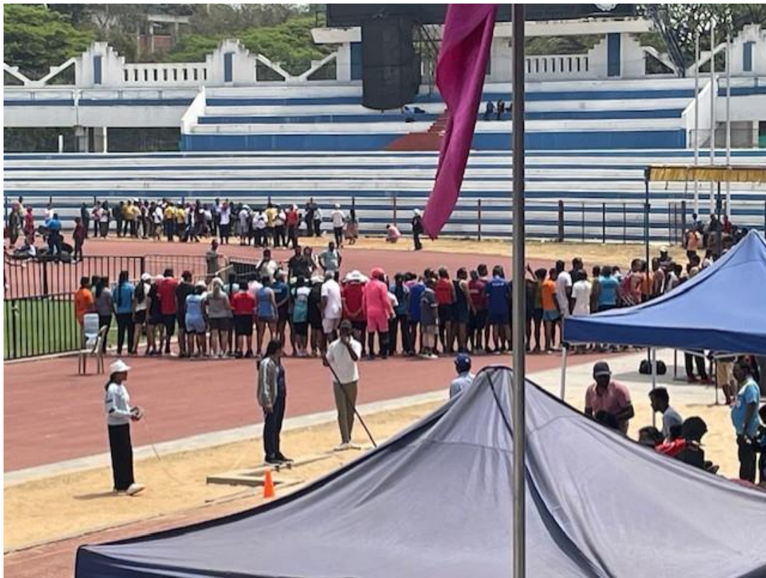
Start of 5000 Race Walk- Indian Masters Championship 2025